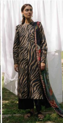
# 035 #