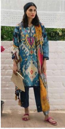
# 031 #