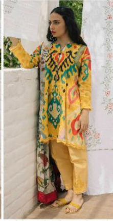
# 032 #