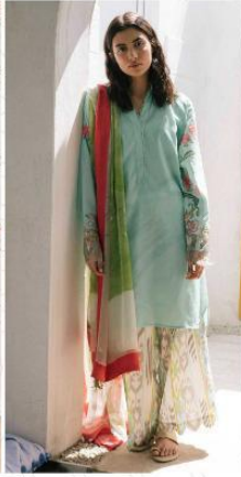
# 033 #