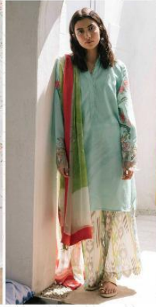
# 033 #