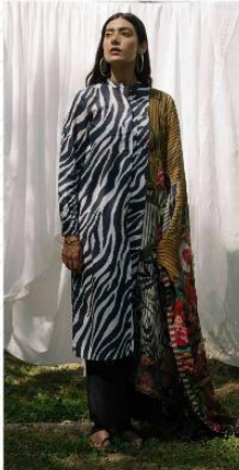
# 034 #