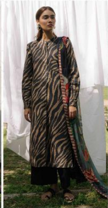
# 035 #