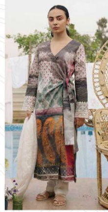
# 037 #