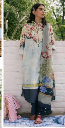
# 039 #