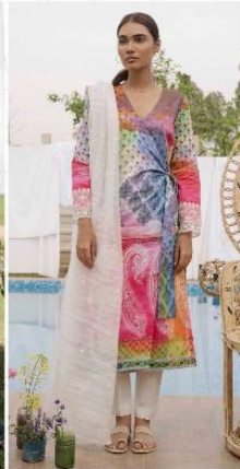
# 036 #