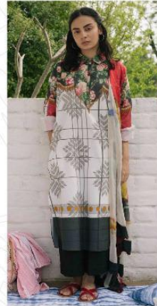
# 038 #