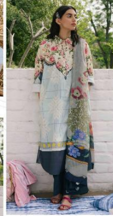
# 039 #