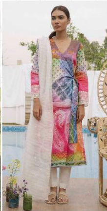
# 036 #