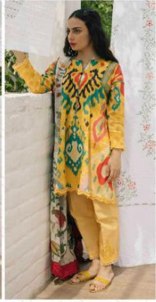
# 032 #