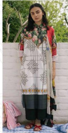
# 038 #