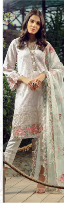
Styal No. 3003