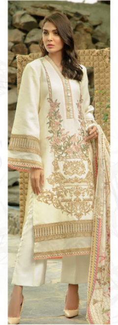
Styal No. 3005