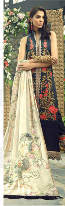
Styal No. 3004