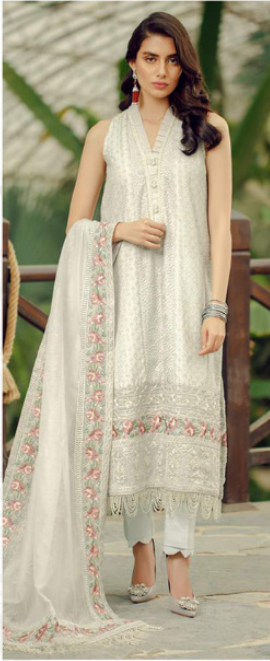
Styal No. 3001