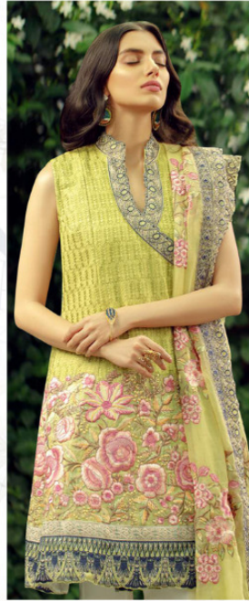
Styal No. 3002