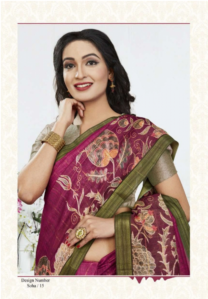
Design Number Soha / 15