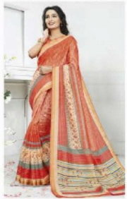
Soha / 13