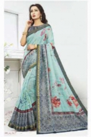
Soha / 14