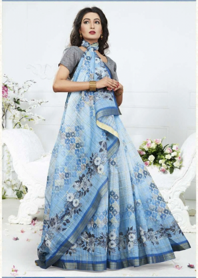
Design Number Soha / 12