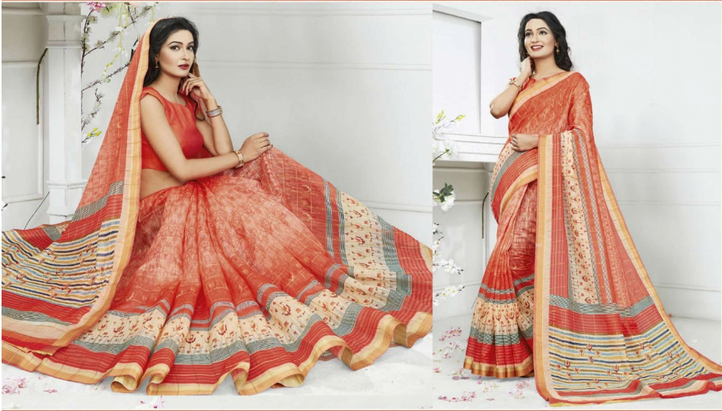
Design Number Soha / 13