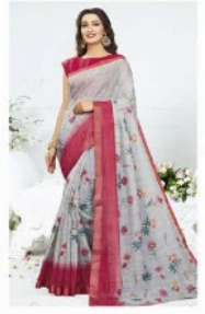
Soha / 11