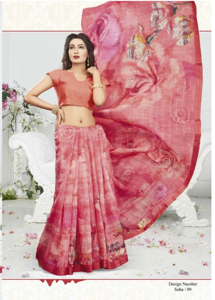
Design Number Soha / 09