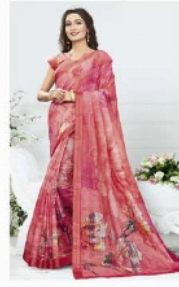
Soha / 09