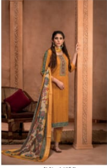
D.No. 1425 B