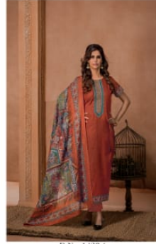
D.No. 1428 A