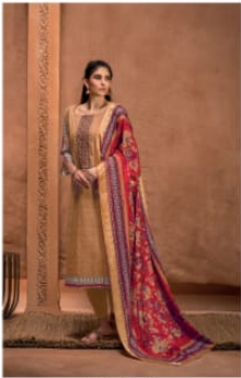
D.No. 1426 A