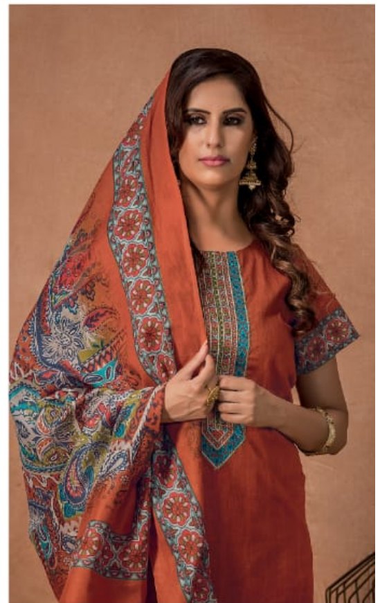
D.No. 1428 B