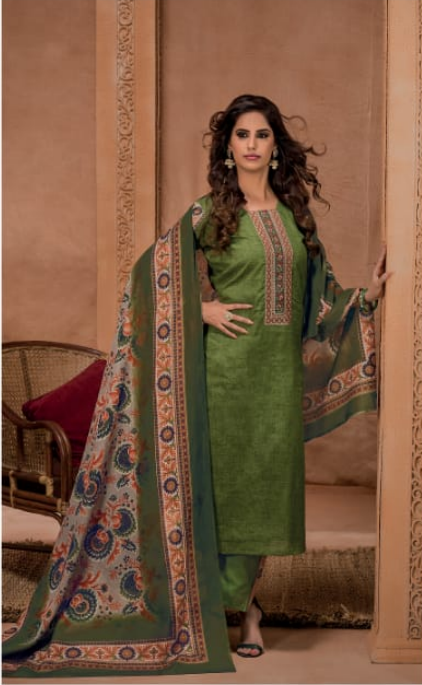
D.No. 1429 A