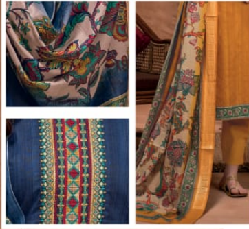
D.No. 1425 B