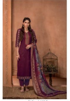
D.No. 1428 B