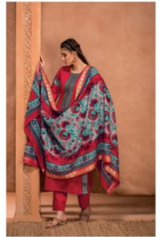
D.No. 1429 B