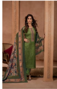
D.No. 1429 A