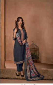
D.No. 1427 A