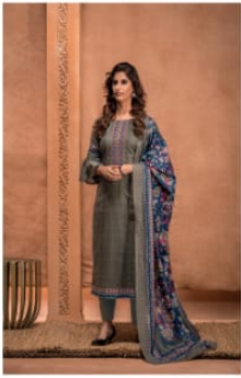
D.No. 1426 B