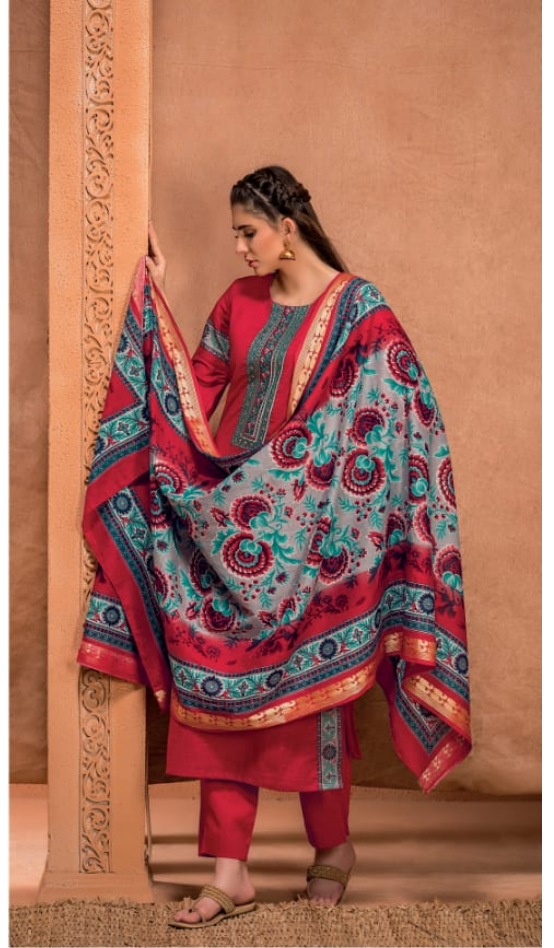
D.No. 1429 B