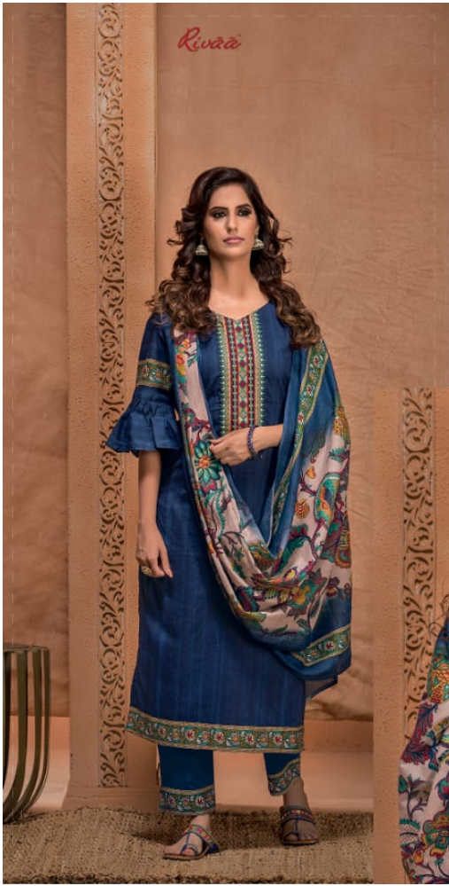
D.No. 1425 A