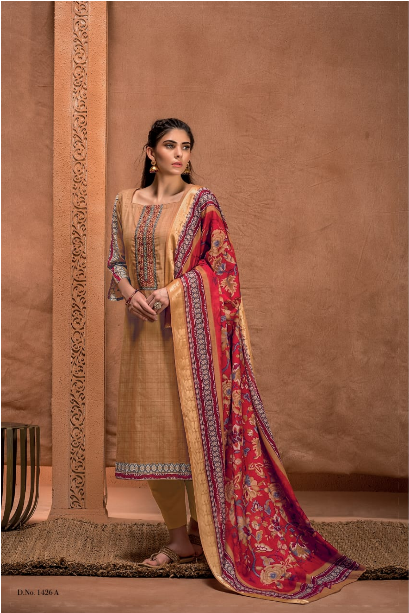
D.No. 1426 A