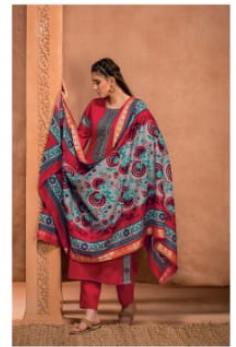
D.No. 1429 B