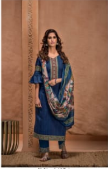
D.No. 1425 A