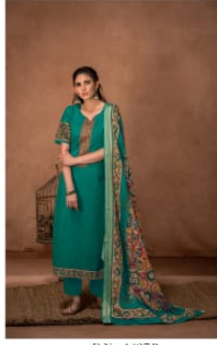
D.No. 1427 B