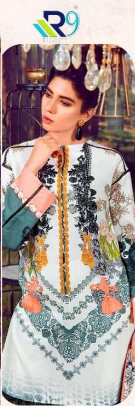
BREEZA Vol-2 Cotton Dupatta Collection