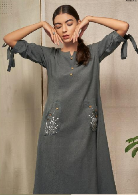
Altering from shades are all set to claim you into the fashion with our latest prima lace collection.