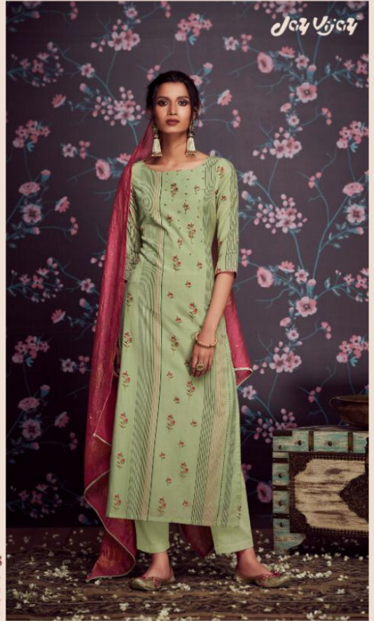
1988 Elegance & sophistication create a charming symphony.