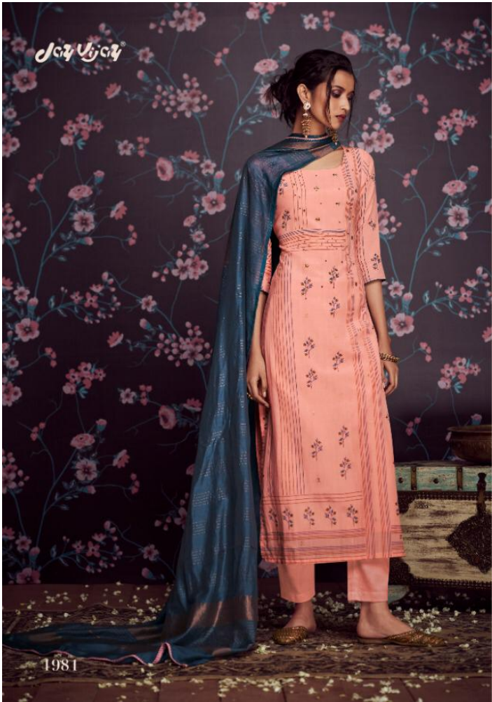
An elegant re-interpretation of fashions classic designs.