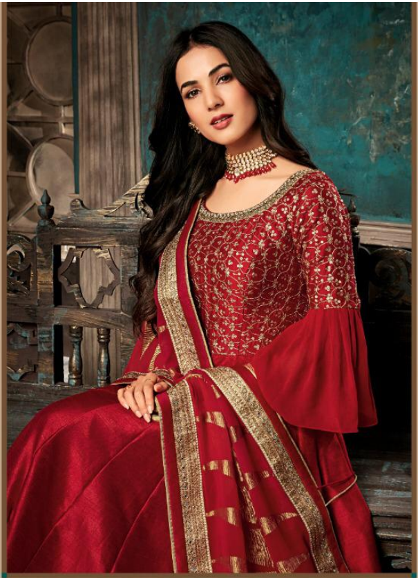
This red dress is savvy and delectable. The soft embroidery work elevates the dress.