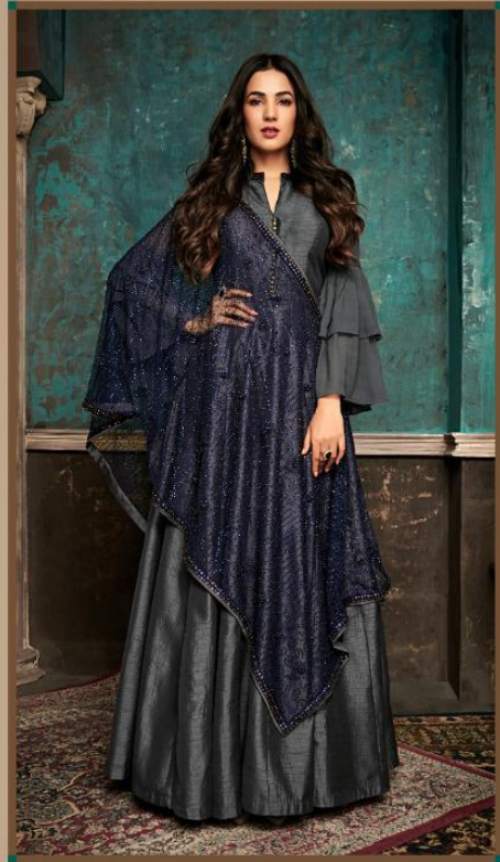
An elegant grey dress with a heavy dupatta, this ensemble is stupendous. It is perfect for all occasions.