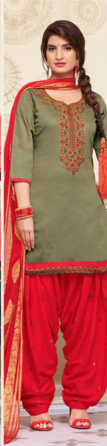
D. NO - 1029