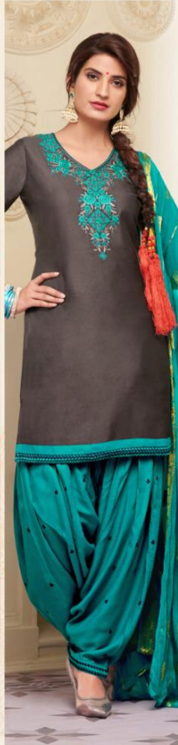
D. NO - 1030