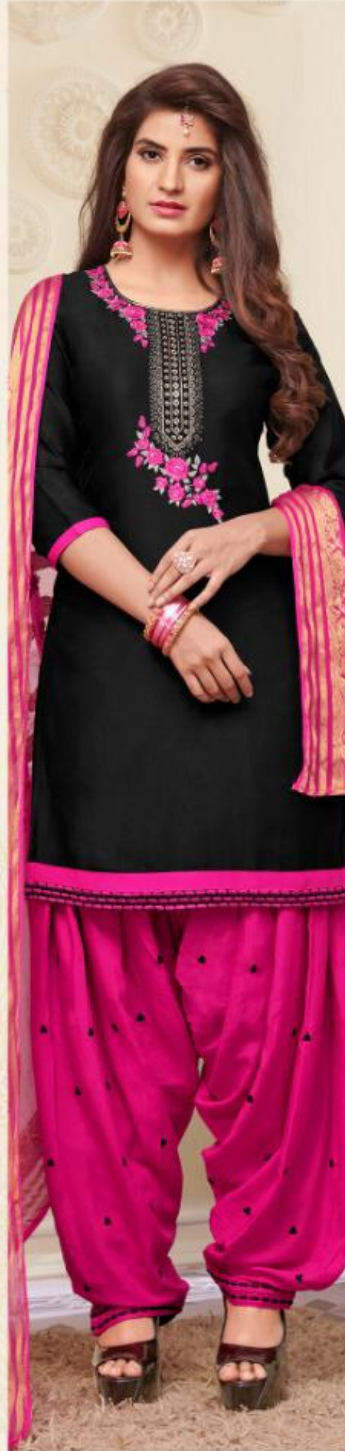
D. NO - 1034