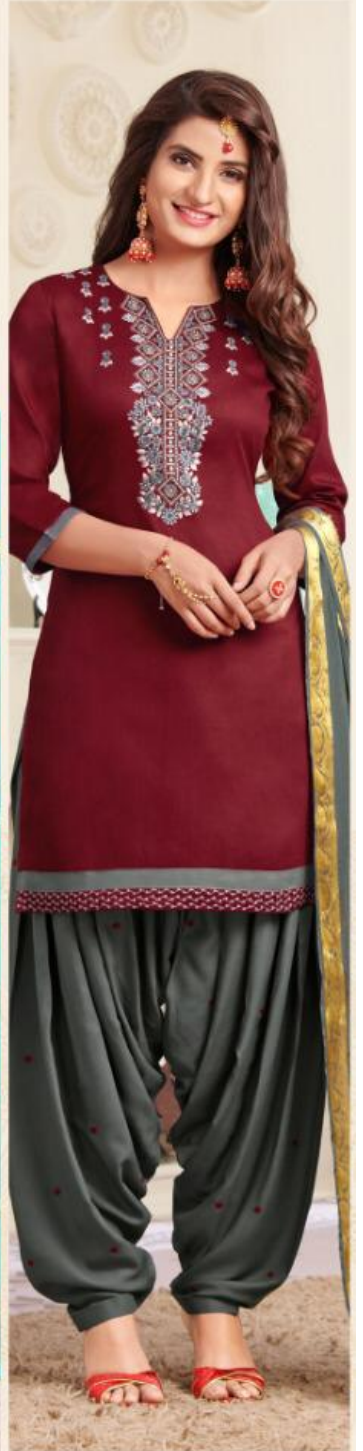
D. NO - 1031