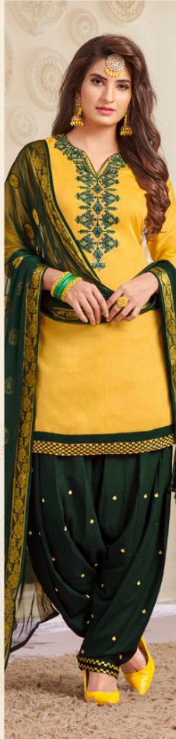
D. NO - 1033