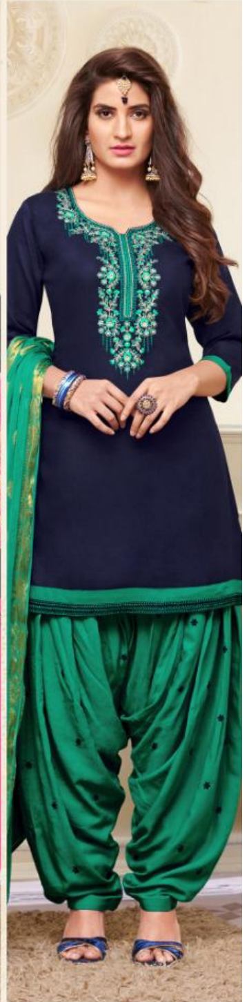
D. NO - 1035