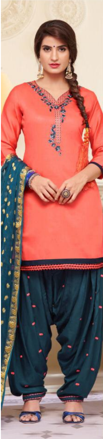
D. NO - 1028