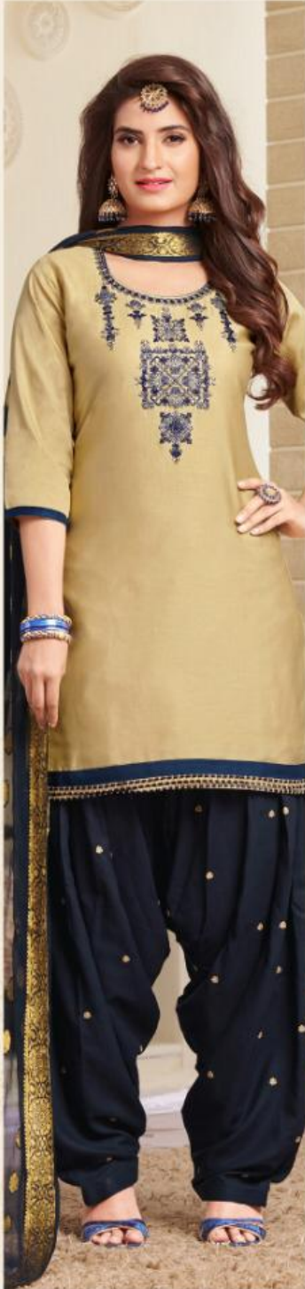
D. NO - 1032