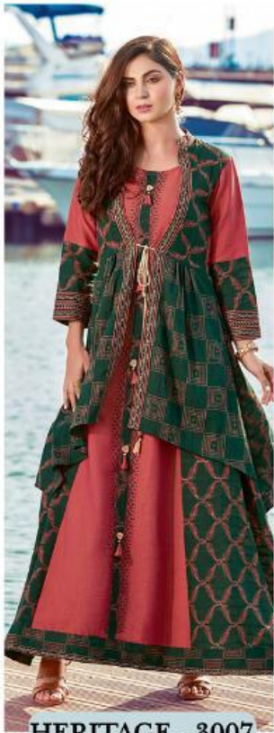
HERITAGE - 3007