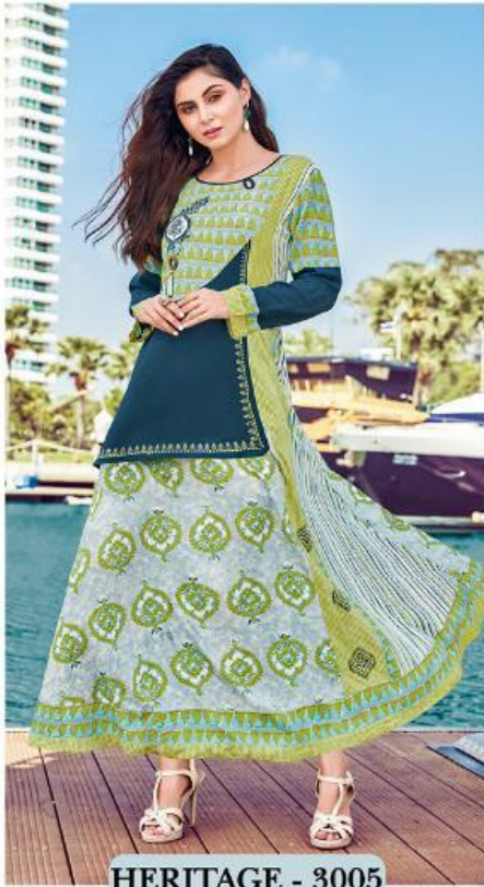
HERITAGE - 3005