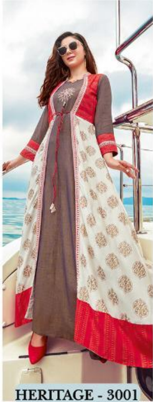
HERITAGE - 3001