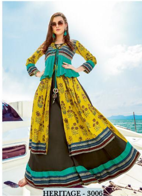
HERITAGE - 3006