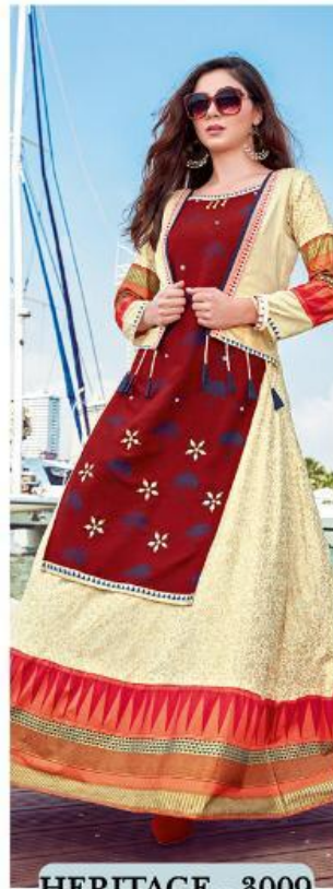
HERITAGE - 3009