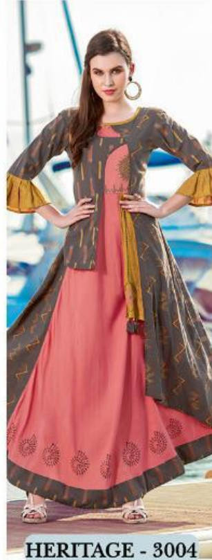
HERITAGE - 3004