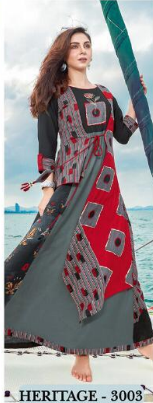
HERITAGE - 3003