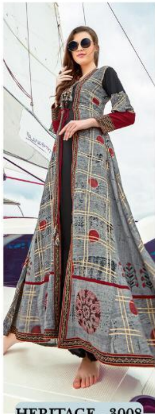
HERITAGE - 3008