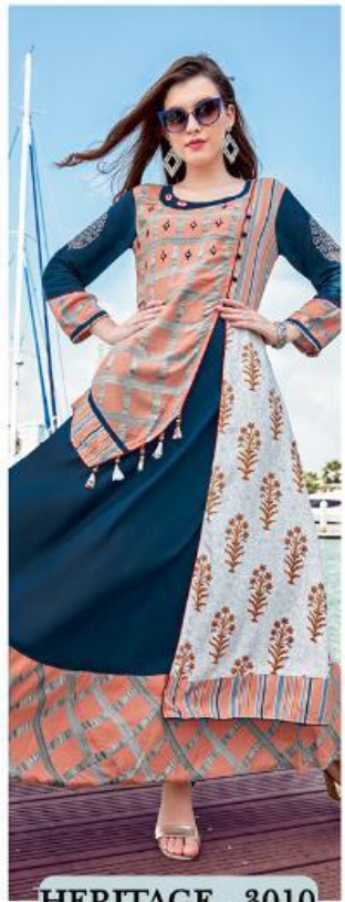
HERITAGE - 3010