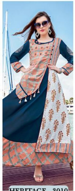
HERITAGE - 3010