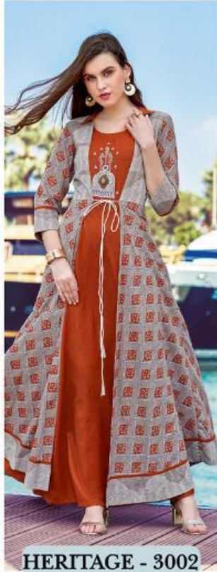
HERITAGE - 3002