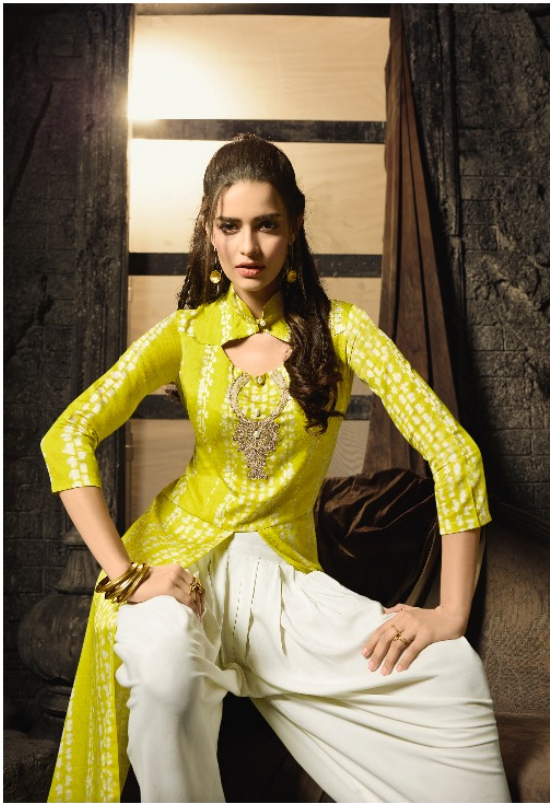
FLAUNT THE SUMMER STYLE.