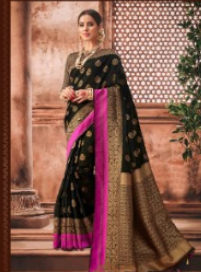
CODE # 907