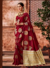
CODE # 903