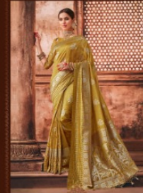
CODE # 908