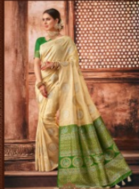
CODE # 902