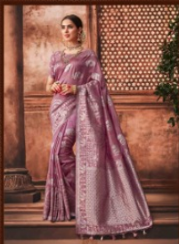
CODE # 904