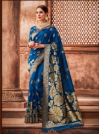
CODE # 901

The hardest thing in fashion is not to be known for a logo, but to be known for a muse. Fashion is what you adopt when you don't know who you are.