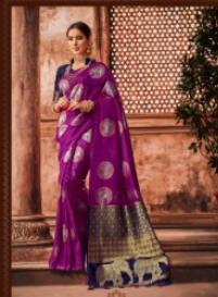
CODE # 909