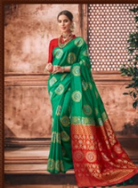
CODE # 905