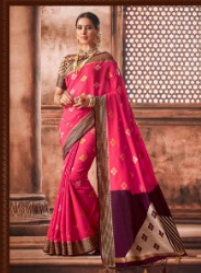
CODE # 906