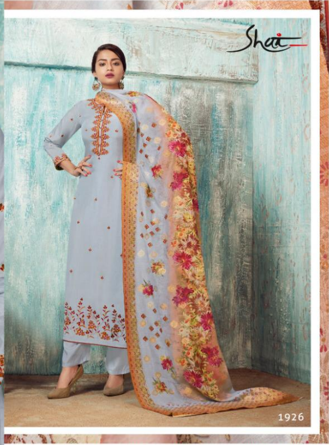
FULFILL YOUR GIRLISH FANTASIES WITH AN EMBELLISHED LOOK HERE MULTI HUED THREAD WORK, DELICATE NET & SEQUINS ENHANCE THE BEAUTY.