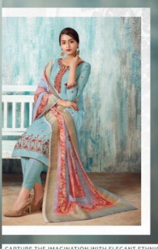
CAPTURE THE IMAGINATION WITH ELEGANT ETHNIC