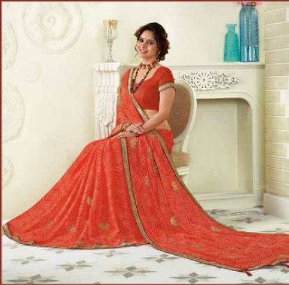
5828 - LADLEE