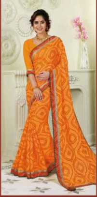
5824 - PARINAAZ