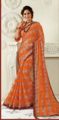
5825 - FORUM