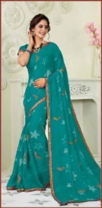
5827 - LADLEE