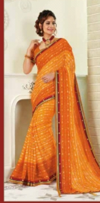
5829 - FORUM