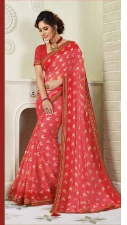
5833 - FORUM