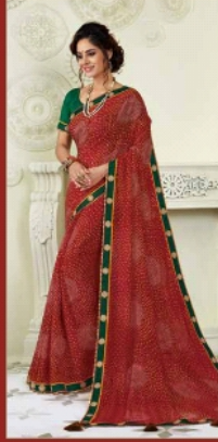
5826 - PARINAAZ