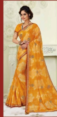
5832 - LADLEE