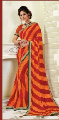
5831 - PARINAAZ