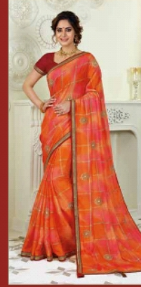
5830 - PARINAAZ