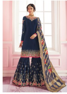
* 8006 *