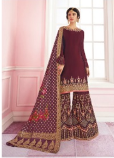
* 8003 *