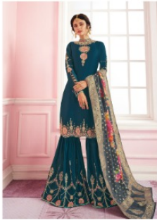
* 8001 *