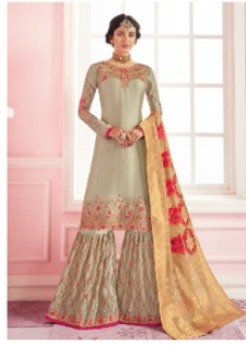
* 8005 *