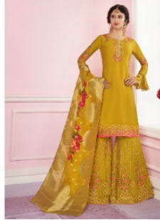
* 8004 *