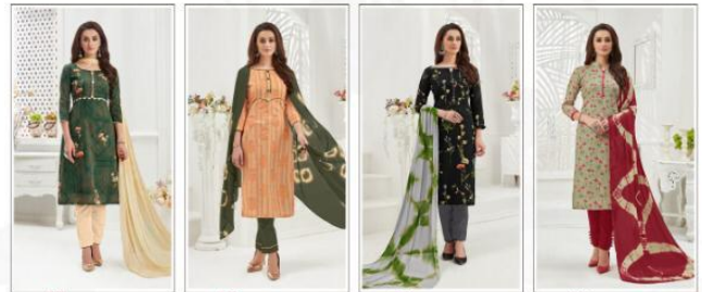
D.No.1409 D.No.1410 D.No.1411 D.No.1412