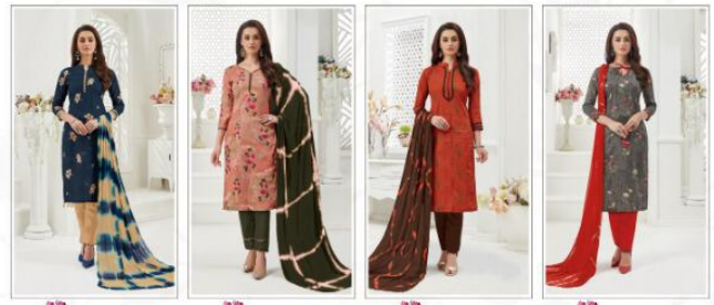
D.No.1401 D.No.1402 D.No.1403 D.No.1404