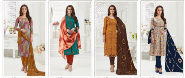
D.No.1405 D.No.1406 D.No.1407 D.No.1408