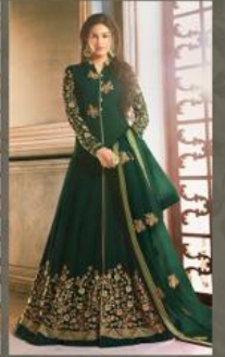
D. No. 9058