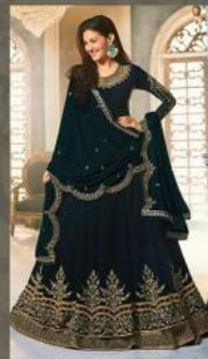
D. No. 9061