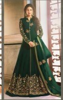
D. No. 9058