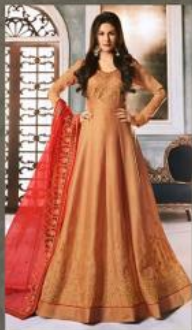
D. No. 9059