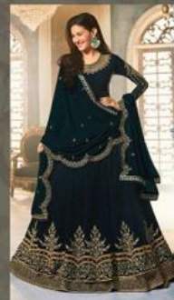
D. No. 9061