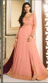
D. No. 9057