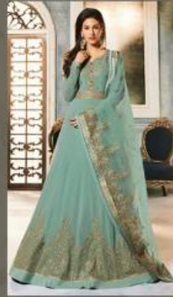
D. No. 9055