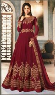
D. No. 9054