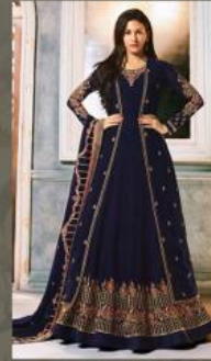
D. No. 9056