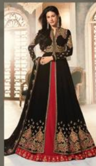
D. No. 9060