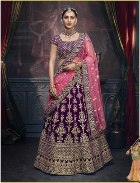
Wine velvet lehenga paired with pink net duppatta and wine velvet blouse. D.NO.-5157