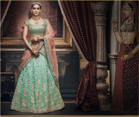
Ferozi shaded handloom silk lehenga paired with peach net dupatta and ferozi handloom silk blouse D.NO.:5154