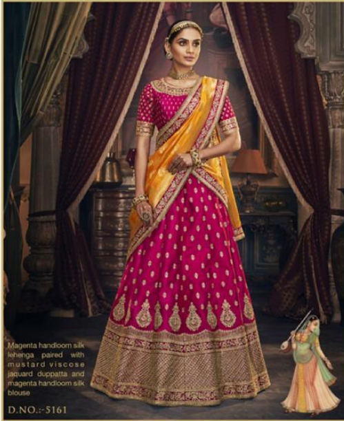
Magenta handloom silk lehenga paired with mustard viscose jacquard dupatta and magenta handloom silk blouse