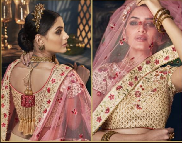
Tussar handloom silk lehenga paired with pink net dupatta and tussar handloom silk blouse D.NO.:-5156