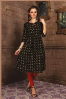
Kitty Party 006