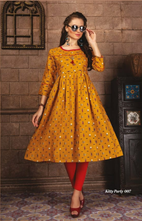
Kitty Party 007