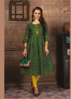
Kitty Party 005