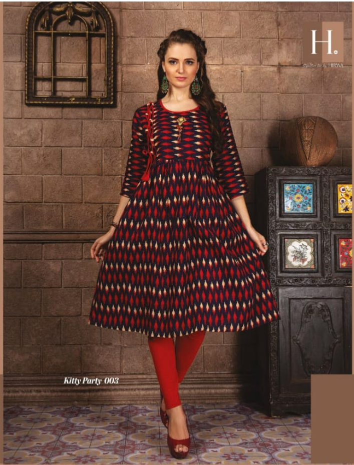
Kitty Party 003

its time to be a little more adventures in fashion and colour, these exotic design gives a sweet feminine touch to your personality