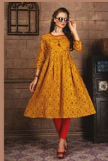
Kitty Party 007