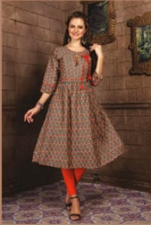
Kitty Party 001