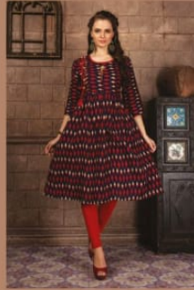
Kitty Party 003