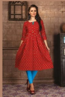
Kitty Party 008