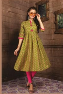
Kitty Party 002