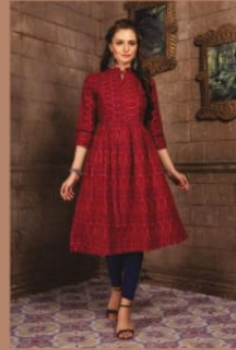
Kitty Party 004