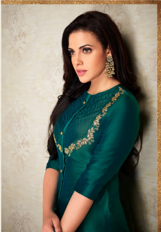
A TIMELESS Moments