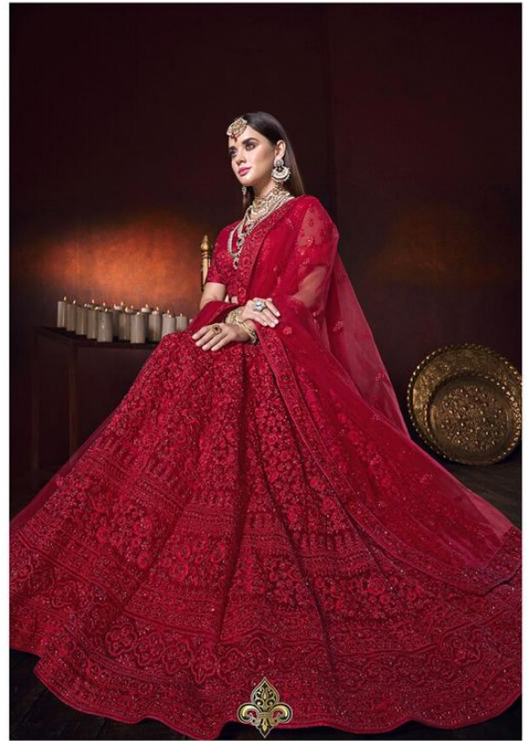
Royal indian womens wear 5116