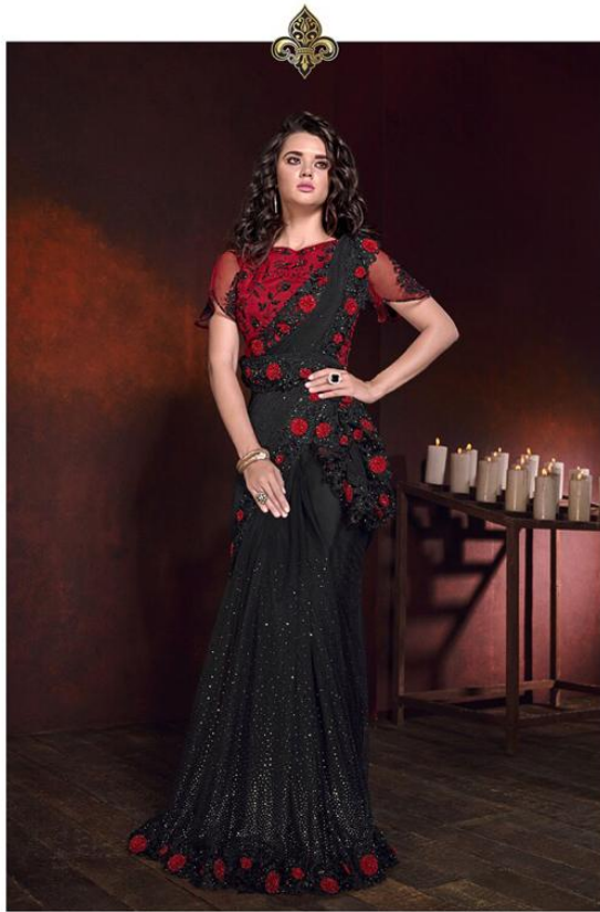
Richly beautifying 5107