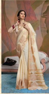
D. No. 9021