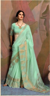
D. No. 9019