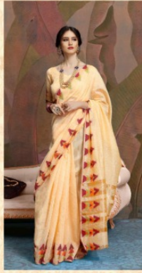
D. No. 9018