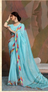
D. No. 9022