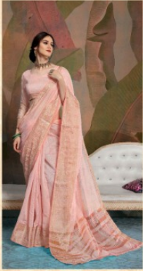
D. No. 9025