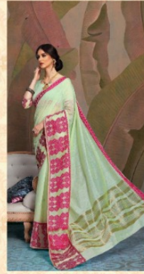
D. No. 9023