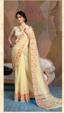
D. No. 9024