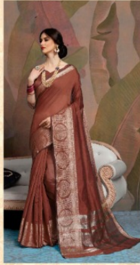
D. No. 9020