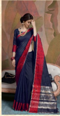
D. No. 9017