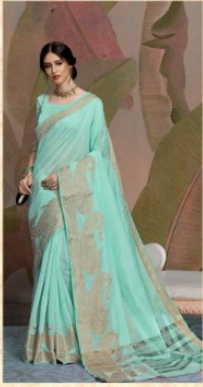
D. No. 9016