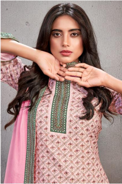
D. No. 851