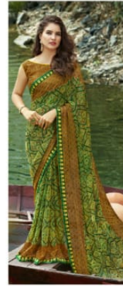
CODE . 20711