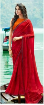
CODE . 20701