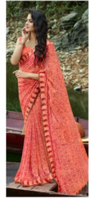
CODE . 20712