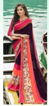
CODE . 20706