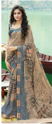
CODE . 20709