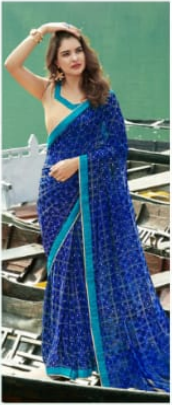
CODE . 20707