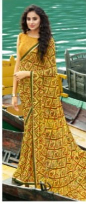
CODE . 20703