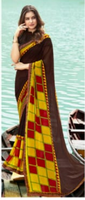
CODE . 20702