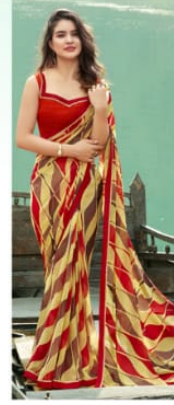
CODE . 20705