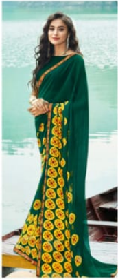
CODE . 20708