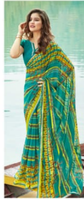
CODE . 20710