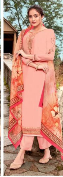
***** * D.No. 13005 *