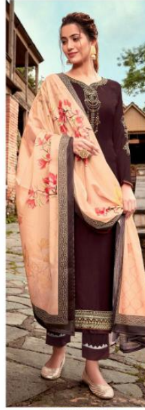
***** * D.No. 13004 *