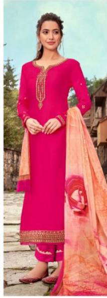
***** * D.No. 13003 *