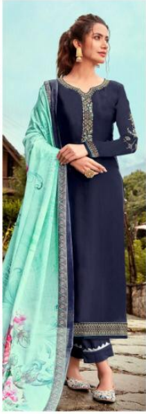
***** * D.No. 13002 *