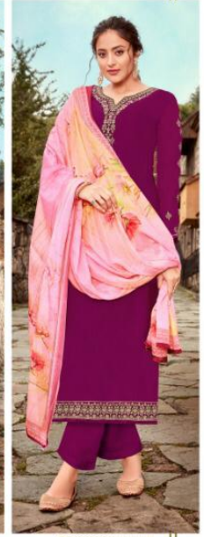
***** * D.No. 13006 *