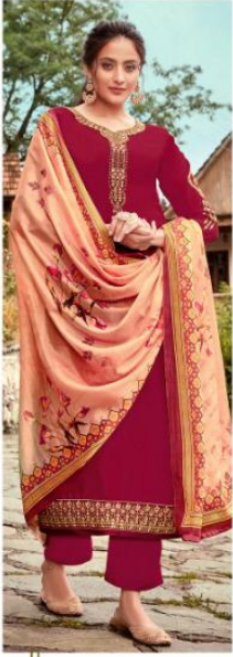
***** * D.No. 13001 *