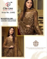
STYAL No. 21002 MARIYAM Vol-02 LUXURY COLLECTION