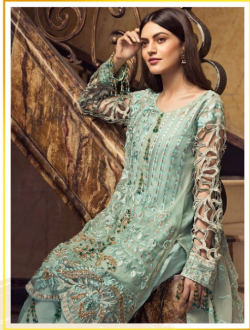
STYAL No . 21001 MARIYAAM Vol-02 LUXURY COLLETION