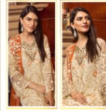
STYAL No. 21005 MARIYAM Vol-02 LUXURY COLLECTION