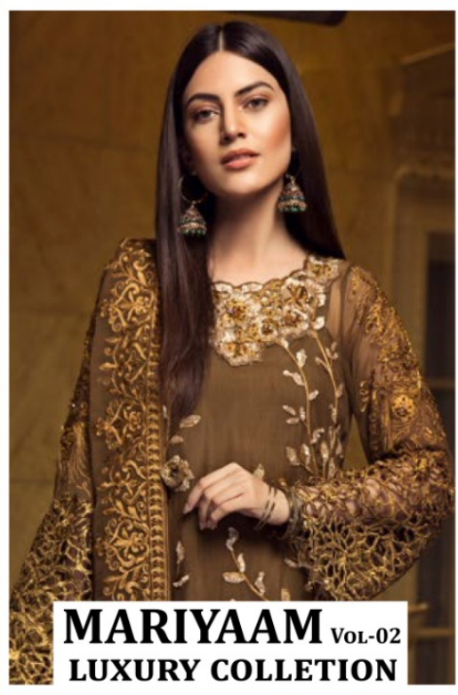
MARIYAAM Vol-02 LUXURY COLLETION