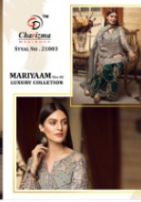
STYAL No. 21003 MARIYAAM Vol-02 LUXURY COLLECTION