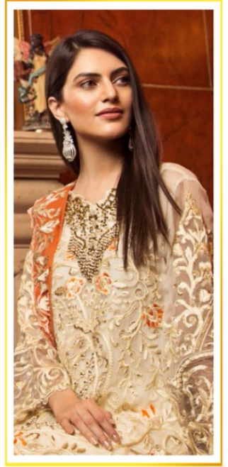
STYAL NO . 21005 MARIYAAM Vol-02 LUXURY COLLETION