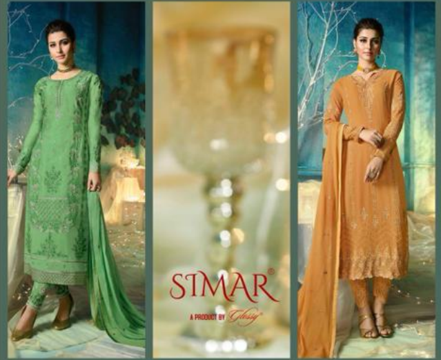
+ 10020 +