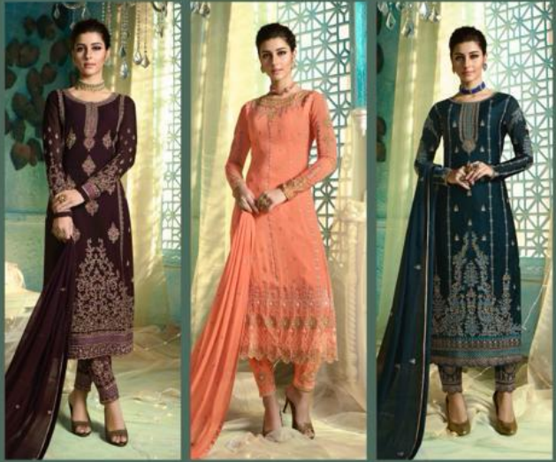
+ 10017 +