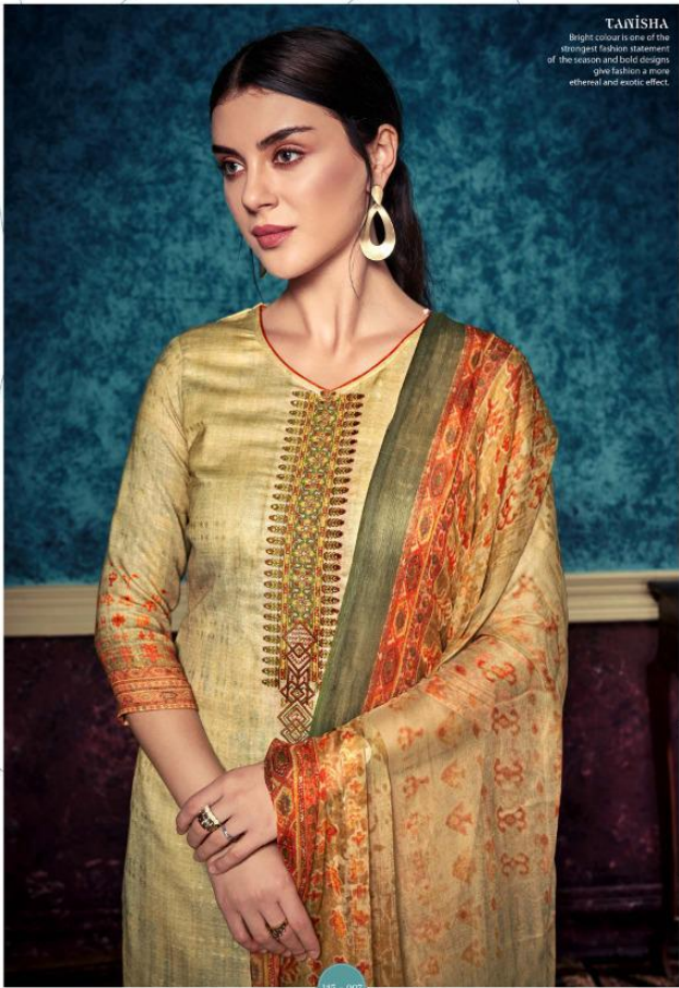
TAWISHA Bright colour is one of the strongest fashion statements of the season and bold designs give fashion a more ethereal and exotic effect.