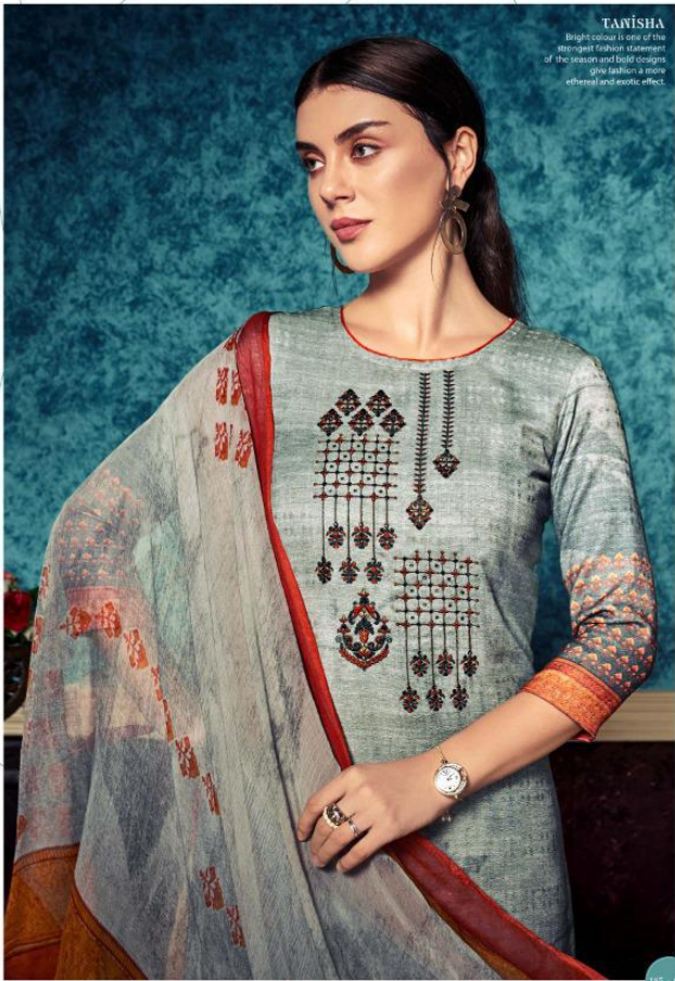
TAWISHA Bright colour is one of the strongest fashion statements of the season and bold designs give fashion a more ethereal and exotic effect.