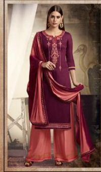
D No 10077