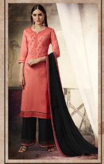
D No 10076