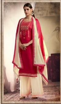
D No 10074