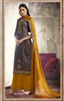
D No 10078