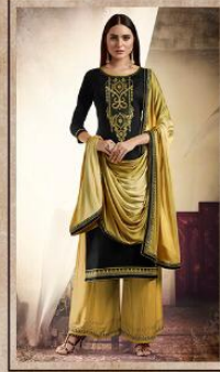
D No 10075