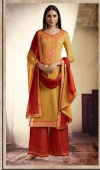
D No 10072