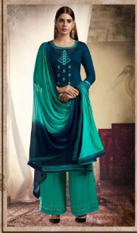
D No 10071