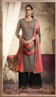
D No 10073