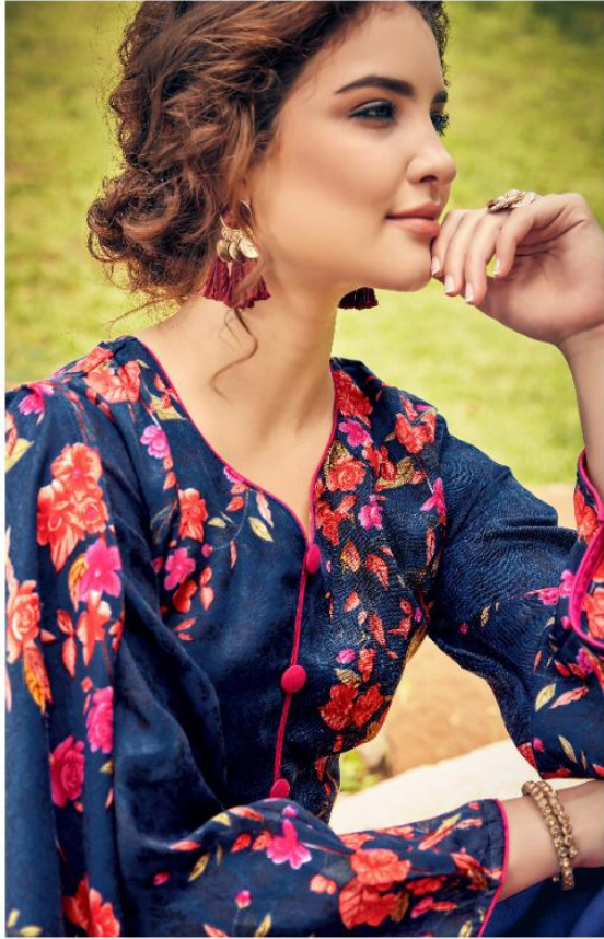
If a woman's dress should be a veil, it should be like a veil that does not obscure the face, serving its purpose without obstructing the view.