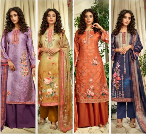
| 875 |