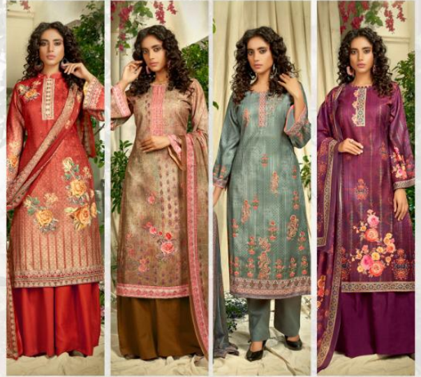
| 879 |