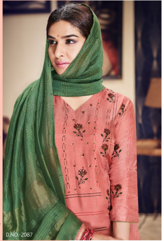
Evoking the values of traditional and magnificent Indian culture.