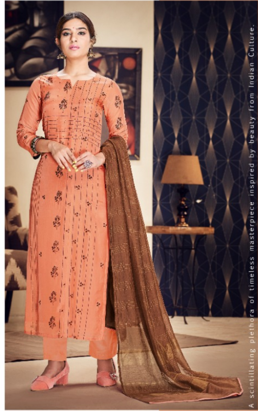
A scintillating plethora of timeless masterpiece inspired by beauty from Indian Culture.