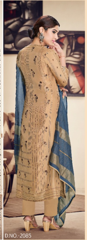
A new classicism of antique designs and innovative use of traditional craft.