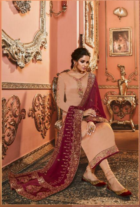
STARTLING PANACHE ● ● ● 22666