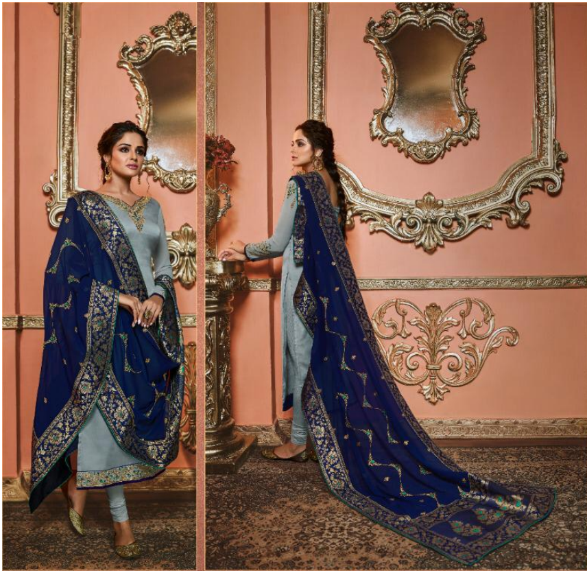
EMBRACE ELEGANCE ●●✻ 22662