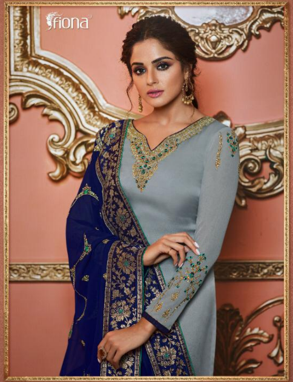
EMBRACE ELEGANCE ●●✻ 22662