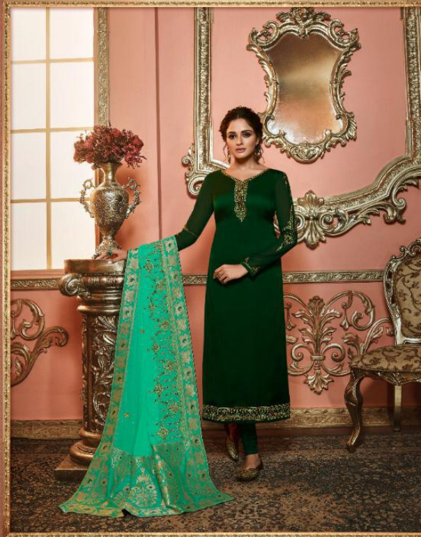
TRADITIONAL SAGA ●●✻ 22661