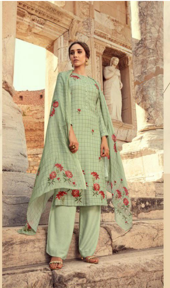
Flower Passage / 467