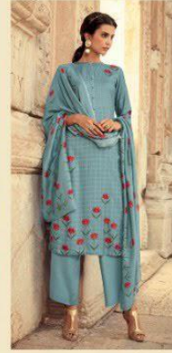
Flower Passage // 492