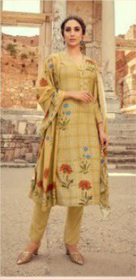
Flower Passage // 499