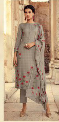
Flower Passage // 480