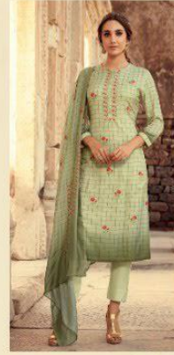
Flower Passage // 408