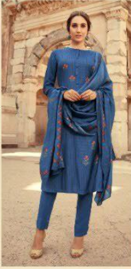
Flower Passage // 460