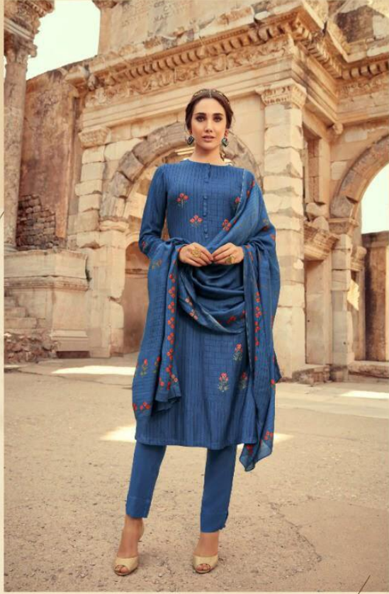
Flower Passage / 460