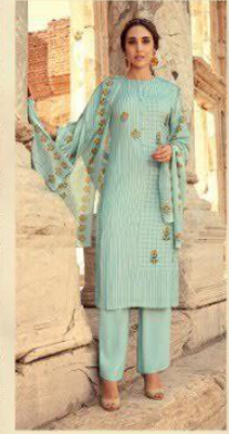
Flower Passage // 448