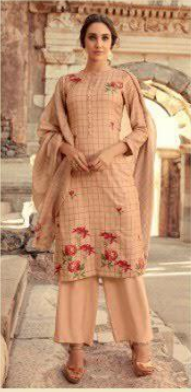
Flower Passage // 465