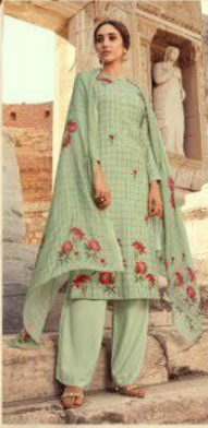
Flower Passage // 467