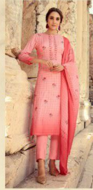
Flower Passage // 409