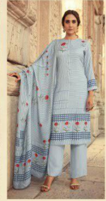
Flower Passage // 404