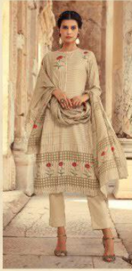
Flower Passage // 428