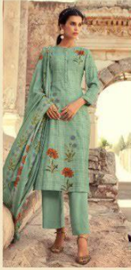
Flower Passage // 497