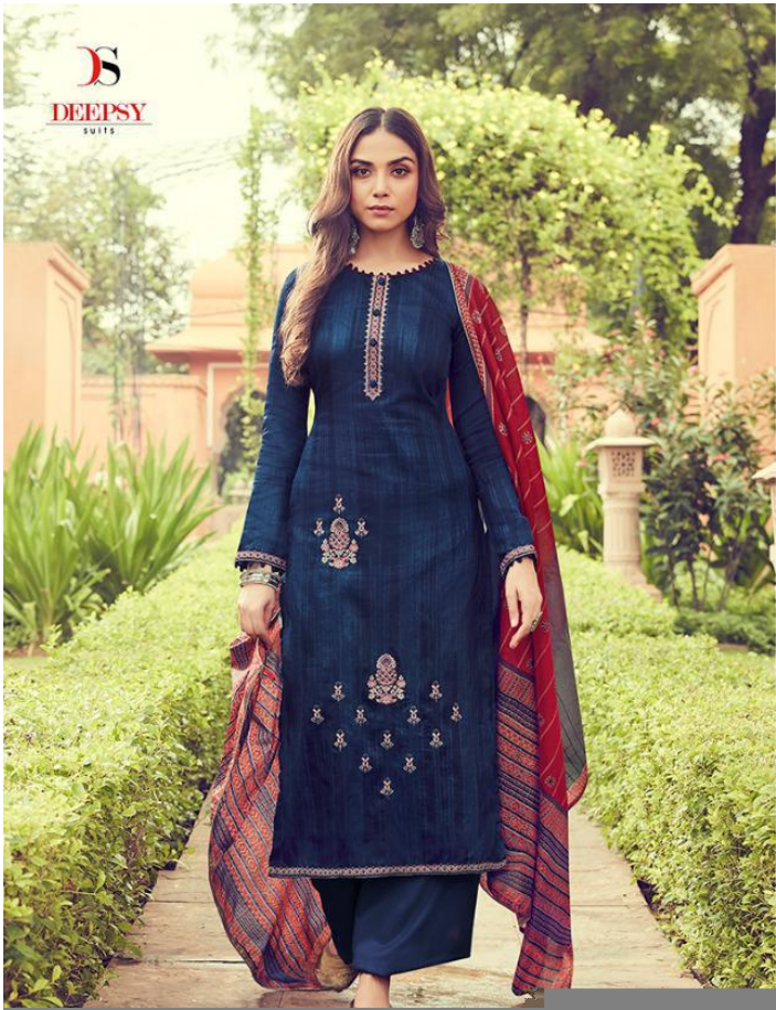
lux fabric, bold patterns and intricate detailing add modern silhouette.