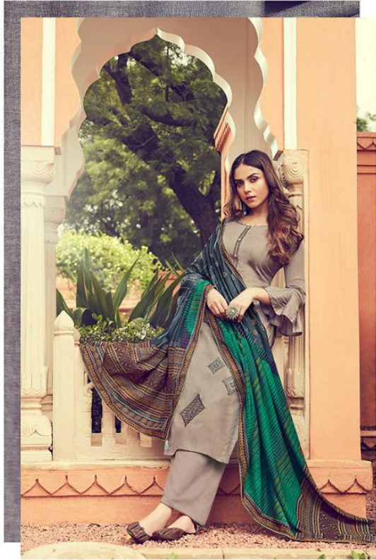
fashionable textures to colors and silhouettes that have inspired trends around the world.