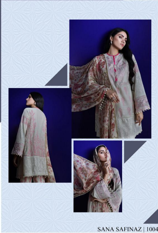
SANA SAFINAZ | 1004