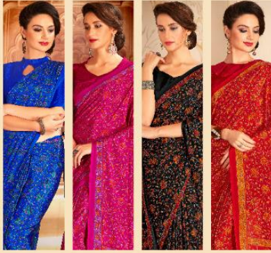
7101a 7101b 7101c 7101d