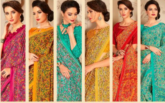
7105a 7105b 7106a 7106b 7107a 7107b