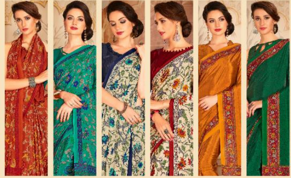
7102a 7102b 7103a 7103b 7104a 7104b