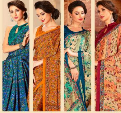
7108a 7108b 7109a 7109b