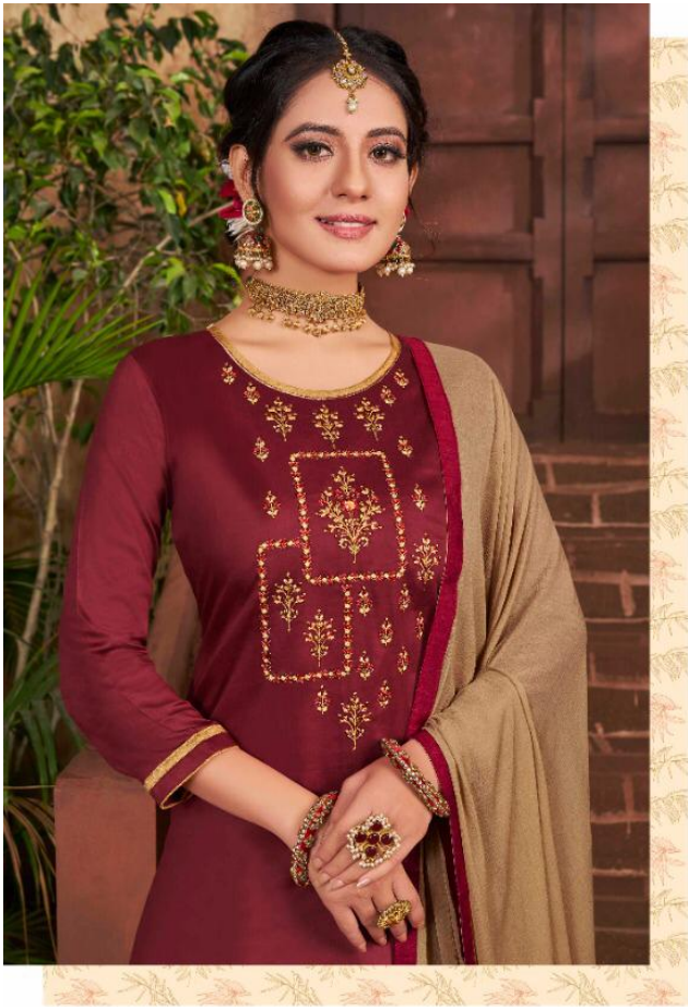
D. NO. -1161