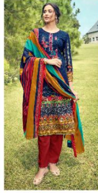
☞ DNo.8005 ☞