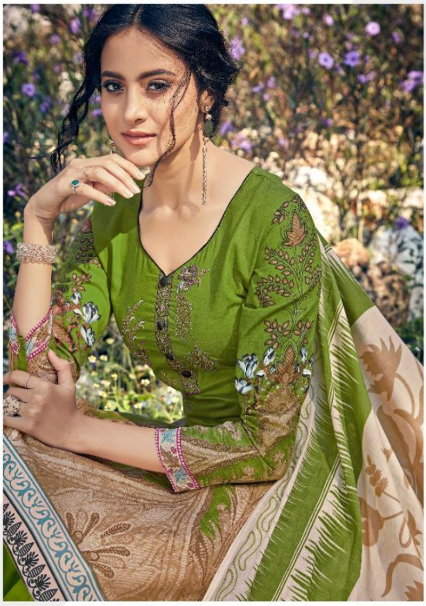
❧ DNo.8008 ❧