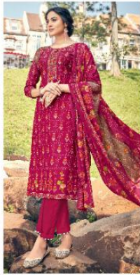
☞ DNo.8009 ☞