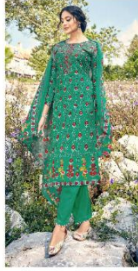
☞ DNo.8004 ☞