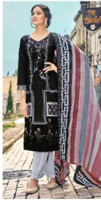
☞ DNo.8010 ☞