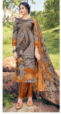
☞ DNo.8006 ☞