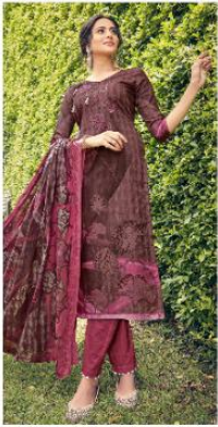
☞ DNo.8007 ☞