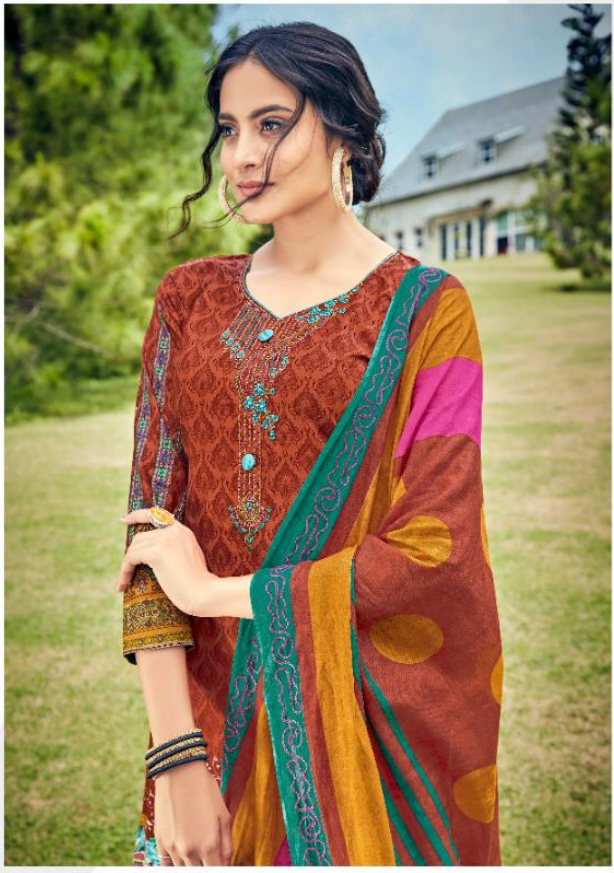
❖ DNo.8003 ❖