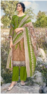
☞ DNo.8008 ☞