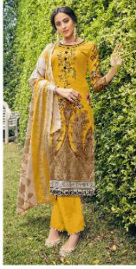
☞ DNo.8002 ☞