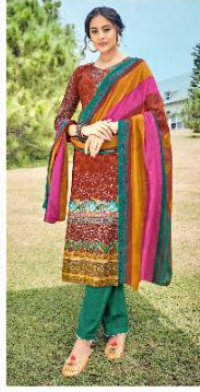
☞ DNo.8003 ☞