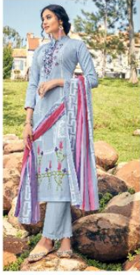
☞ DNo.8001 ☞