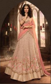
* 21002 *