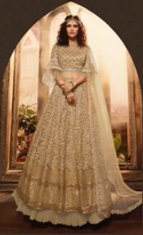
• 21003 •