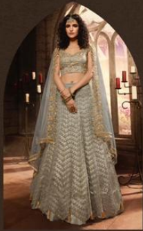
* 21001 *