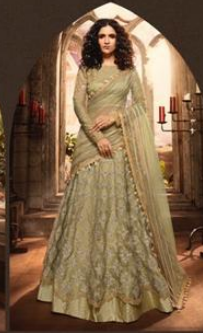
* 21005 *