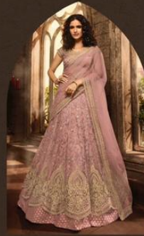
* 21004 *