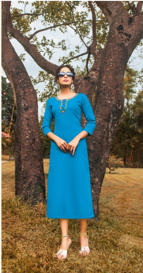
India, there are a couple of hundred Indian fashion designers producing designs and trends. Some are well known and are expanding, slowly but surely, into the international market.