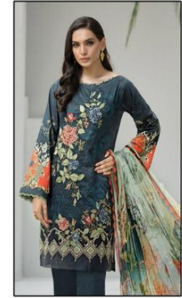
❖ 2010 ❖