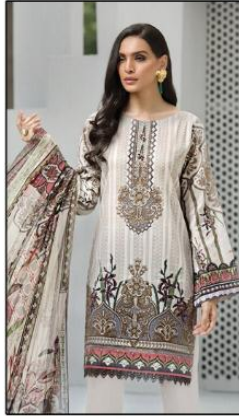
❖ 2002 ❖