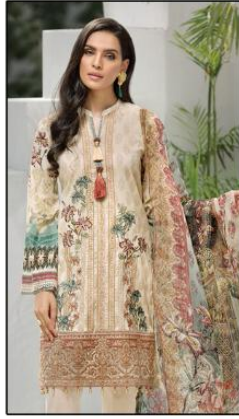
❖ 2003 ❖