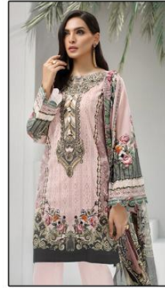
❖ 2007 ❖