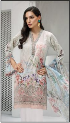
❖ 2006 ❖