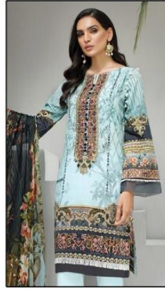
❖ 2004 ❖