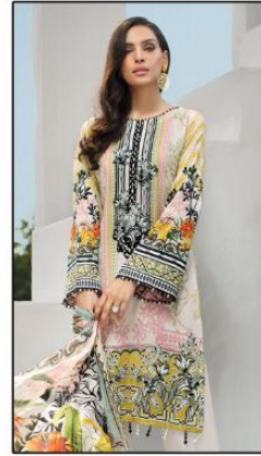
❖ 2009 ❖