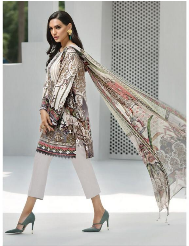
2002 GYPSY FLEUR