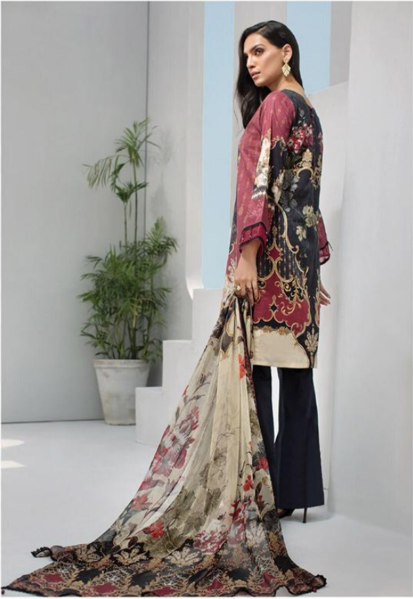
2001 TURKISH TALE