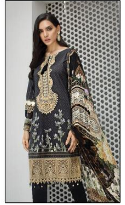
❖ 2005 ❖