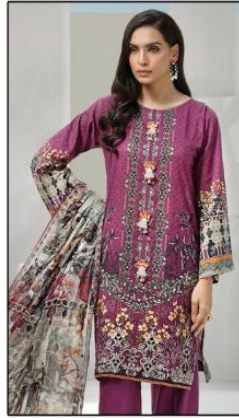
❖ 2008 ❖