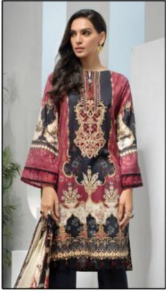
❖ 2001 ❖