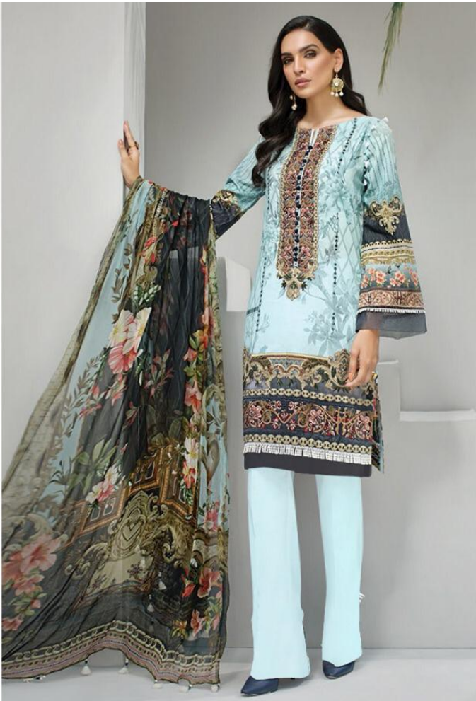
❖ 2004 ❖ AQUA AZURE