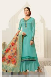
D. No. 12034