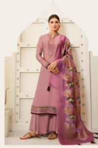
D. No. 12033