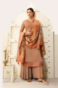
D. No. 12036