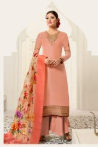
D. No. 12031