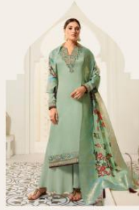
D. No. 12032