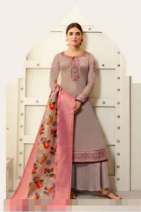
D. No. 12035