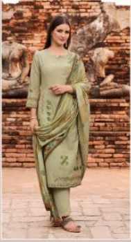
◀ 911 ▶