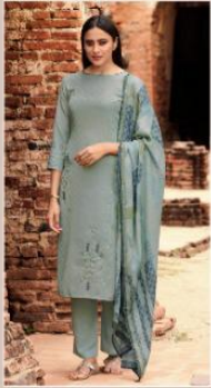
◀ 915 ▶