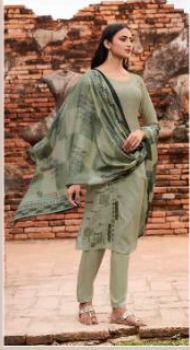
◀ 912 ▶