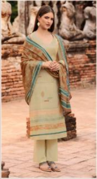
◀ 914 ▶