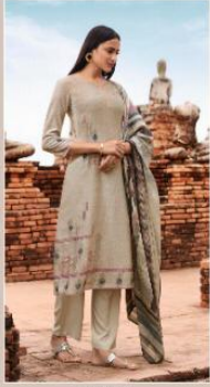
◀ 913 ▶