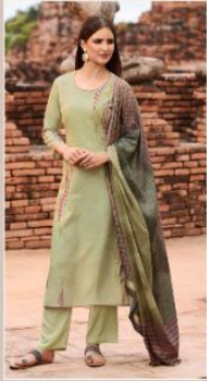
◀ 916 ▶