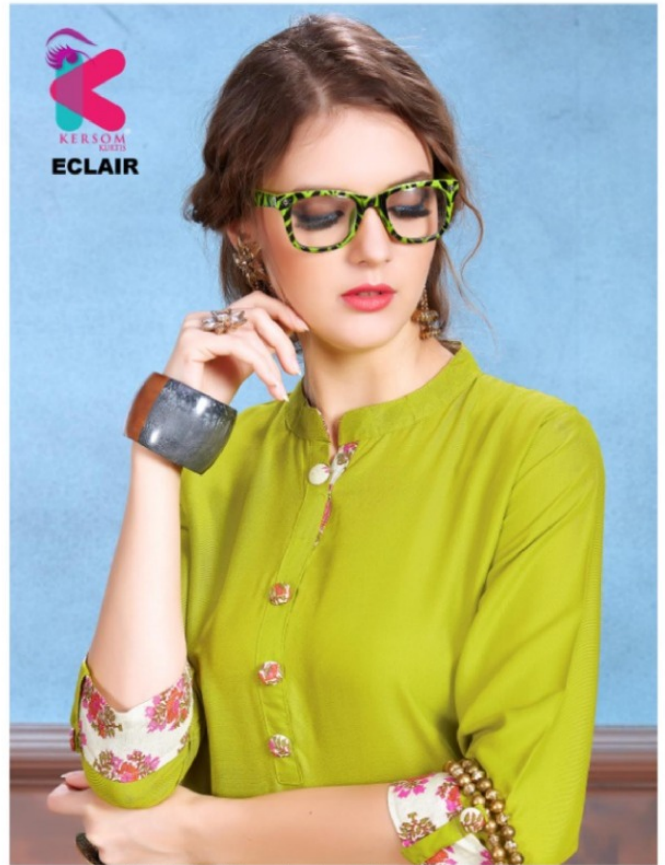
the height of feminine fashion excellence elegant, stylish, graceful and exceptionally classy..