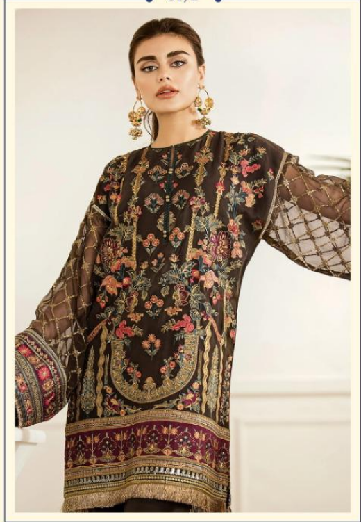
BAROQUE EMBROIDERED COLLECTION