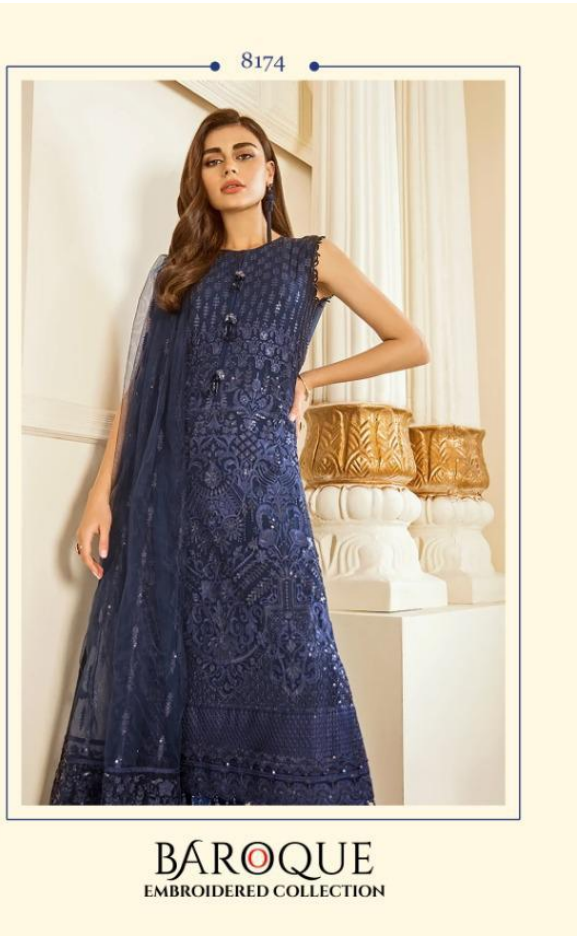
BAROQUE EMBROIDERED COLLECTION