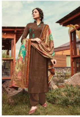
CODE # 1002