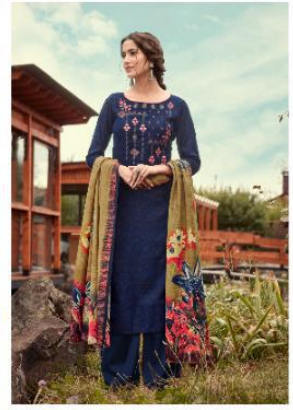
CODE # 1004