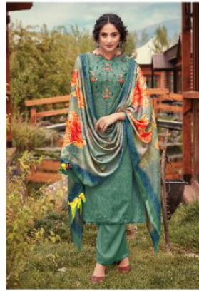
CODE # 1007