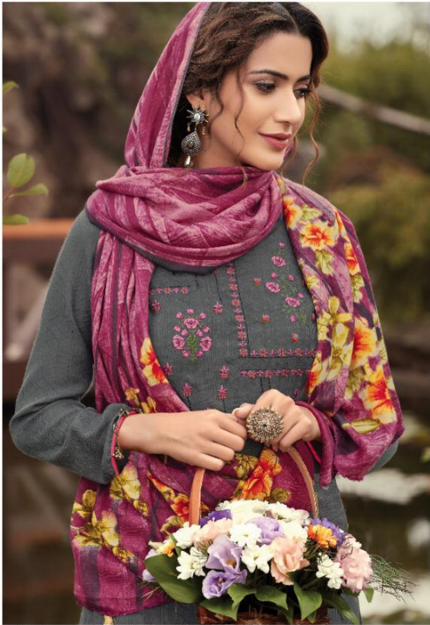
Now the style for women with true colors dress with eye-catching theme & dazzling designs.