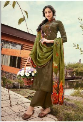
CODE # 1005