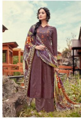
CODE # 1003