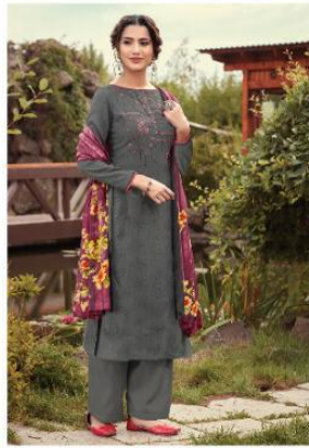
CODE # 1006