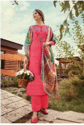
CODE # 1001