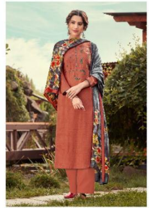
CODE # 1008