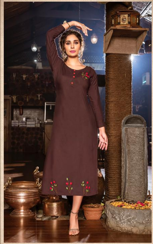
D.no - 1008