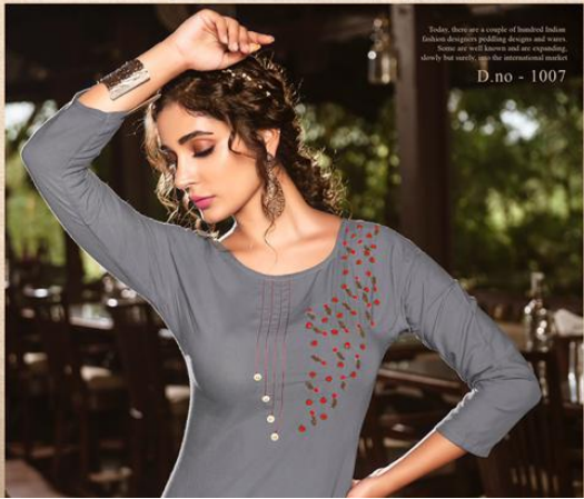
India, there are a couple of hundred Indian fashion designers producing designs and many of them are well known and are expanding slowly but surely in the international market. D.no - 1007