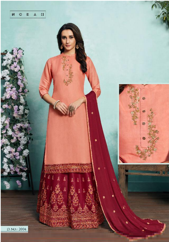
D. No.: 2004