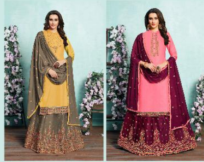
D. No.: 2001