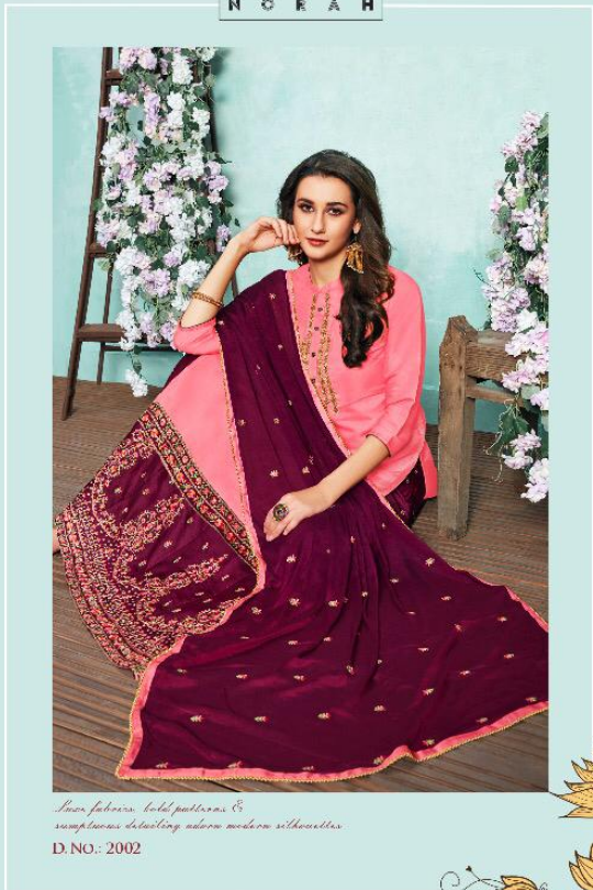
Lean fabrics, bold patterns & sumptuous detailing adorn modern silhouettes. D. NO.: 2002