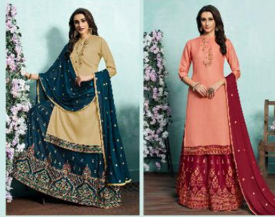
D. No.: 2003