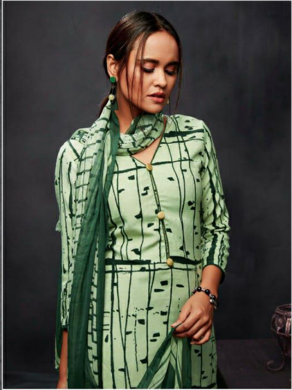
Now's the time to be a little more adventures in prints and colours of your dress experience the exotic floral look and attitude.